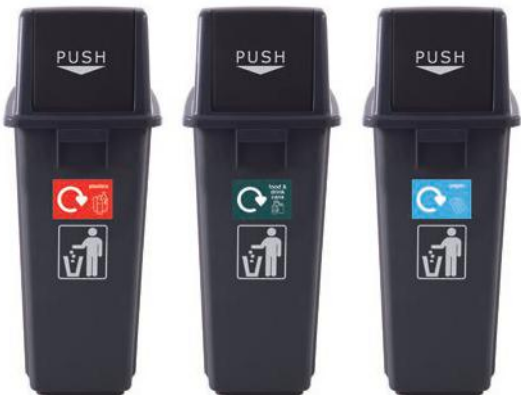
RCY63Z Set of 3