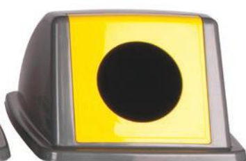
Yellow Round Aperture Lid