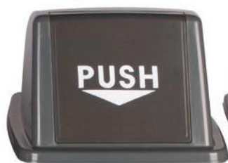
Push Flap Lid