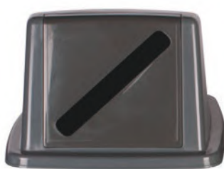
Push Slot Lid