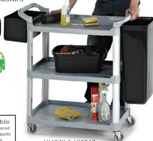
HI424Y &amp; HI004Z

Assembly Available To have the product delivered to you assembled please quote code & price with order