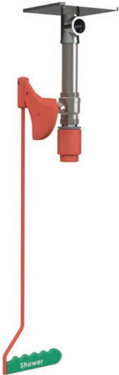
Ceiling Mounted EXP-23GS/V