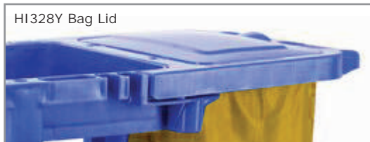
HI328Y Bag Lid