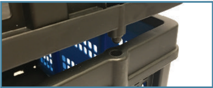
Folding Box Male & Female Connectors