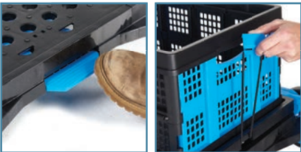
Brake Mechanism Box Fixing Mechanism