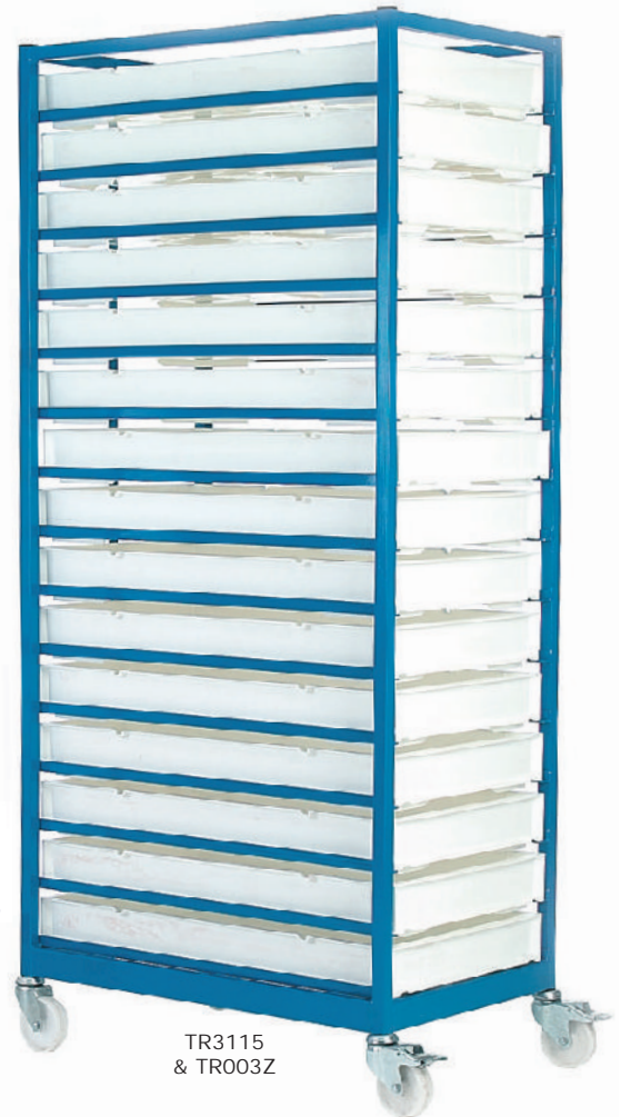
TR3115 & TR003Z