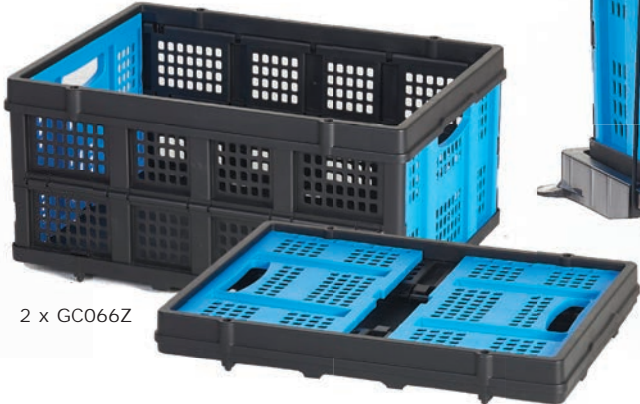
2 x GC066Z