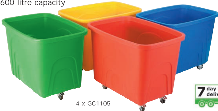
4 x GC1105